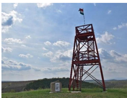
Gazebo in Szomolya