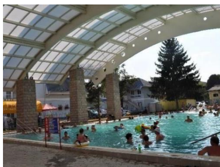
Thermal Spa Bogács