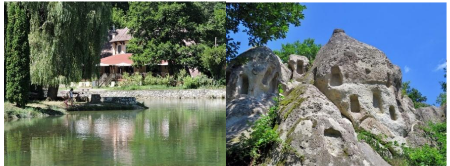
Recreational resort Síkfőkút Szomolya Hive-stones